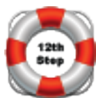
12th Step Calls