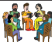
Meeting Info Calls