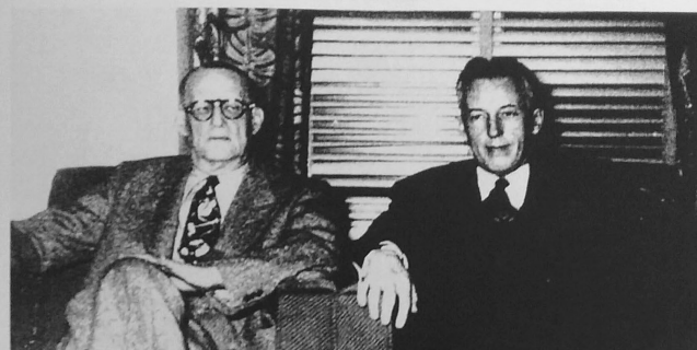
Area 36 Archives Committee Presents...