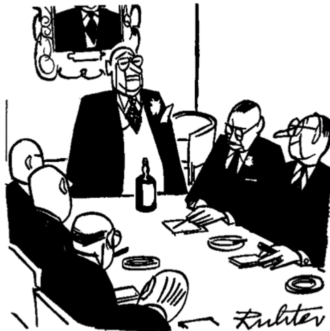
“This is a special brand we’ve blended for the man of no consequence”

From Alcoholics Anonymous , p. 64, reprinted with permission of AA World Services, Inc.