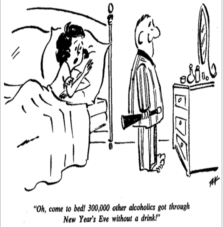
Cartoons reprinted by permission of the A.A. Grapevine, Inc.