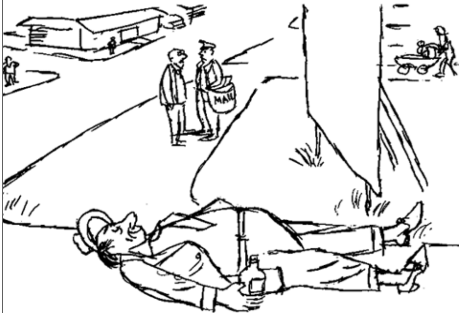
"He says he'd try AA but he's afraid his neighbors will find out he's a drunk."

From Alcoholics Anonymous , p. 95, reprinted by permission of A.A. World Services, Inc.